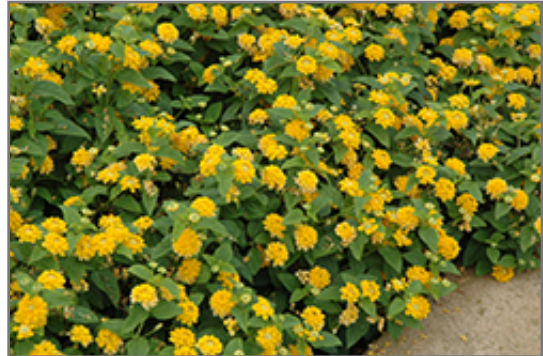
Little Lucky Pot Of Gold Lantana flowers

Little Lucky Pot Of Gold Lantana is recommended for the following landscape applications;