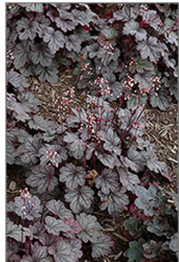
Carnival Rose Granita Coral Bells in bloom