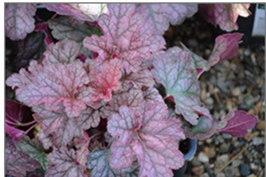
Kira Purple Rain Forest Coral Bells foliage