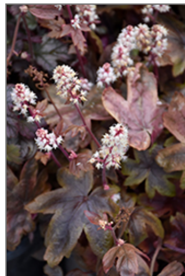
Brass Lantern Foamy Bells flowers