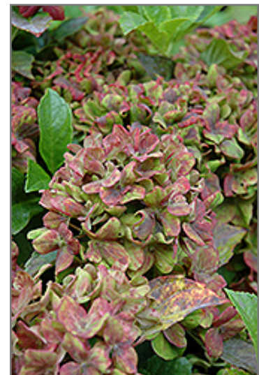
Pistachio Hydrangea flowers