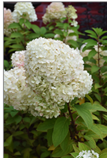
Bobo Hydrangea flowers