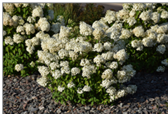
Bobo Hydrangea in bloom