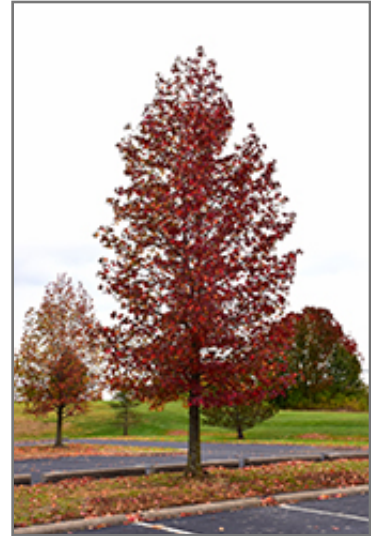
Happidaze Sweet Gum in fall