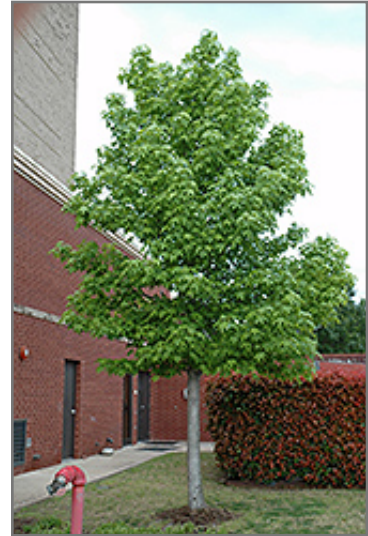
Happidaze Sweet Gum

This tree should only be grown in full sunlight. It prefers to grow in average to moist conditions, and shouldn't be allowed to dry out. It is very fussy about its soil conditions and must have rich, acidic soils to ensure success, and is subject to chlorosis (yellowing) of the foliage in alkaline soils. It is somewhat tolerant of urban pollution. This is a selection of a native North American species.