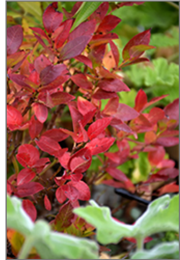
Jelly Bean Blueberry in fall

Jelly Bean Blueberry features dainty clusters of white bell-shaped flowers with shell pink overtones hanging below the branches in mid spring. It has red-variegated green foliage. The glossy oval leaves turn an outstanding red in the fall. It features an abundance of magnificent blue berries in mid summer.