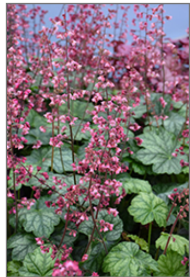
Berry Timeless Coral Bells flowers