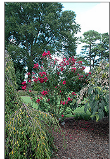
Pink Velour Crapemyrtle in bloom