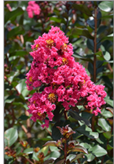
Pink Velour Crapemyrtle flowers