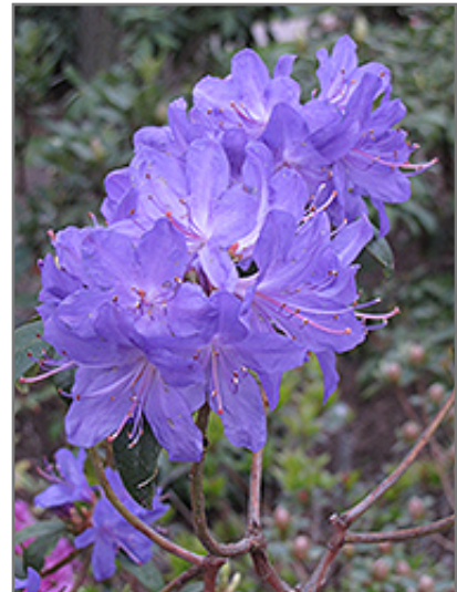
Blue Baron Rhododendron flowers