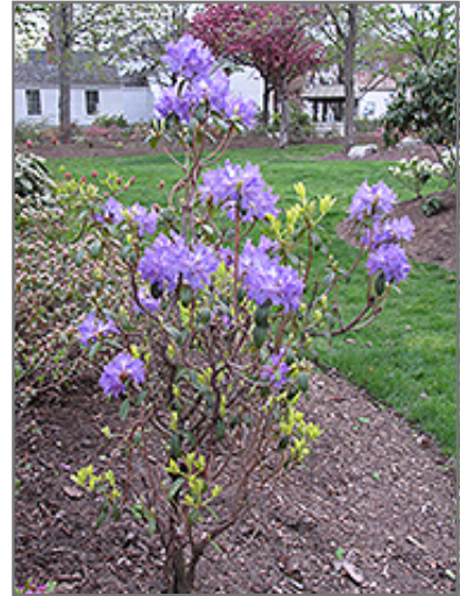
Blue Baron Rhododendron in bloom

This shrub does best in full sun to partial shade. You may want to keep it away from hot, dry locations that receive direct afternoon sun or which get reflected sunlight, such as against the south side of a white wall. It requires an evenly moist well-drained soil for optimal growth, but will die in standing water. It is very fussy about its soil conditions and must have rich, acidic soils to ensure success, and is subject to chlorosis (yellowing) of the foliage in alkaline soils. It is somewhat tolerant of urban pollution, and will benefit from being planted in a relatively sheltered location. Consider applying a thick mulch around the root zone in winter to protect it in exposed locations or colder microclimates. This particular variety is an interspecific hybrid.