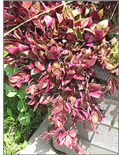
Purple Wandering Jew

Purple Wandering Jew is recommended for the following landscape applications;