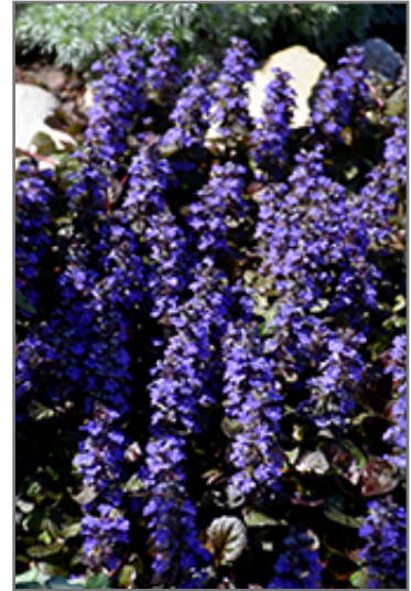
Mahogany Bugleweed flowers

This plant does best in partial shade to shade. It does best in average to evenly moist conditions, but will not tolerate standing water. It is not particular as to soil type or pH. It is somewhat tolerant of urban pollution. Consider covering it with a thick layer of mulch in winter to protect it in exposed locations or colder microclimates. This is a selected variety of a species not originally from North America. It can be propagated by division; however, as a cultivated variety, be aware that it may be subject to certain restrictions or prohibitions on propagation.