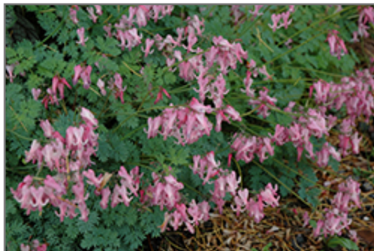
Amore Pink Bleeding Heart in bloom

Amore Pink Bleeding Heart is recommended for the following landscape applications;