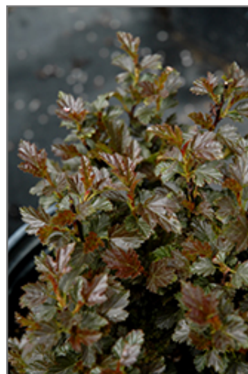
Tiny Wine Ninebark foliage