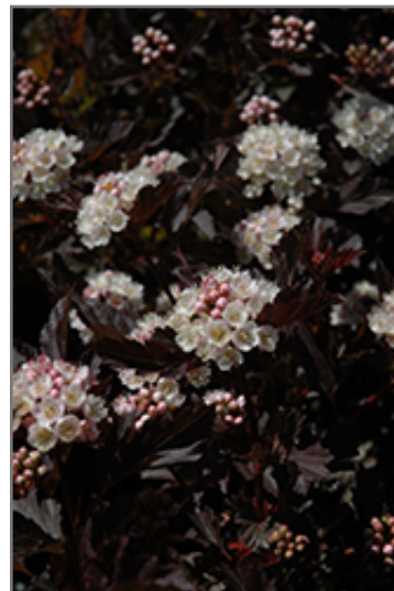
Tiny Wine Ninebark flowers

This shrub will require occasional maintenance and upkeep, and can be pruned at anytime. It has no significant negative characteristics.