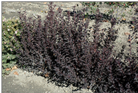
Tiny Wine Ninebark

This shrub does best in full sun to partial shade. It is very adaptable to both dry and moist locations, and should do just fine under average home landscape conditions. It is not particular as to soil type or pH. It is highly tolerant of urban pollution and will even thrive in inner city environments. This is a selection of a native North American species.