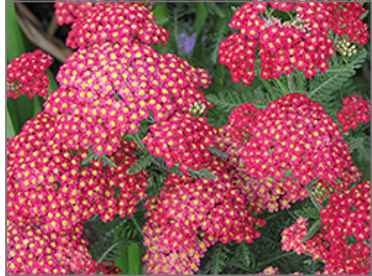
Galaxy Paprika Yarrow flowers