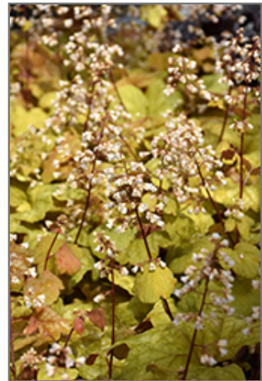
Champagne Coral Bells flowers