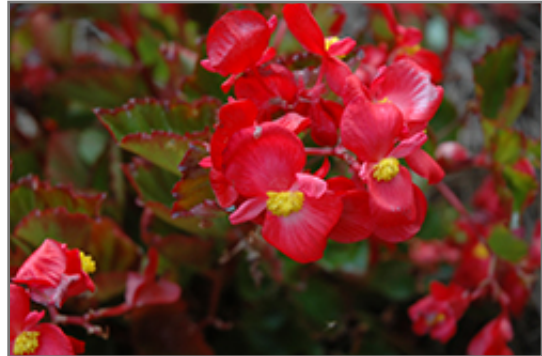
BabyWing Red Begonia flowers

BabyWing Red Begonia is a fine choice for the garden, but it is also a good selection for planting in outdoor containers and hanging baskets. It is often used as a 'filler' in the 'spiller-thriller-filler' container combination, providing a mass of flowers and foliage against which the thriller plants stand out. Note that when growing plants in outdoor containers and baskets, they may require more frequent waterings than they would in the yard or garden.