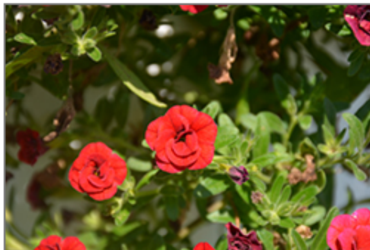
MiniFamous Double Compact Red Calibrachoa flowers