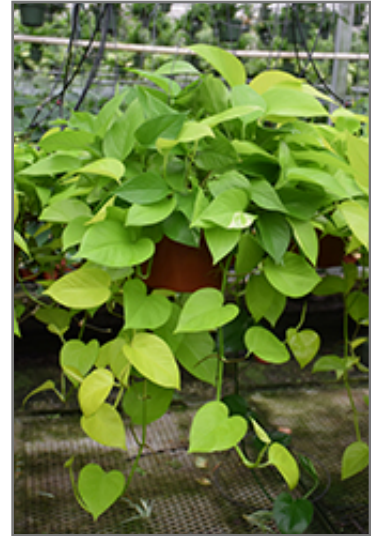
Neon Pothos in full

When grown indoors, Neon Pothos can be expected to grow to be about 5 feet tall at maturity, with a spread of 24 inches. It grows at a fast rate, and under ideal conditions can be expected to live for approximately 10 years. This houseplant performs well in both bright or indirect sunlight and strong artificial light, and can therefore be situated in almost any well-lit room or location. It does best in average to evenly moist soil, but will not tolerate standing water. The surface of the soil shouldn't be allowed to dry out completely, and so you should expect to water this plant once and possibly even twice each week. Be aware that your particular watering schedule may vary depending on its location in the room, the pot size, plant size and other conditions; if in doubt, ask one of our experts in the store for advice. It is not particular as to soil type or pH; an average potting soil should work just fine. Be warned that parts of this plant are known to be toxic to humans and animals, so special care should be exercised if growing it around children and pets.