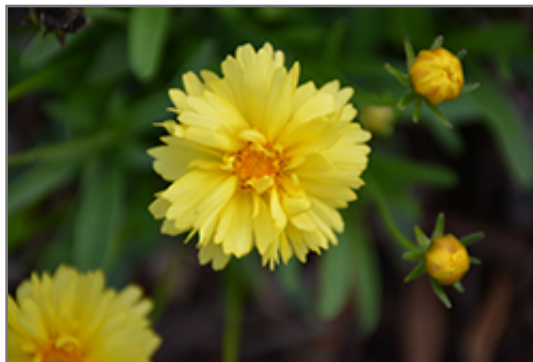
Leading Lady Charlize Tickseed flowers

Leading Lady Charlize Tickseed is recommended for the following landscape applications;