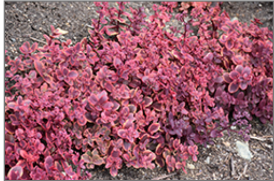
Sunsparkler Wildfire Stonecrop