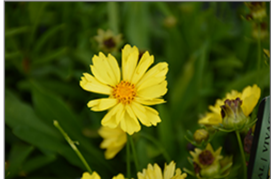
Leading Lady Sophia Tickseed flowers

Leading Lady Sophia Tickseed is recommended for the following landscape applications;