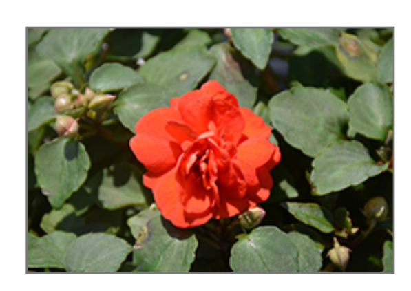
Rockapulco Dark Orange Impatiens flowers