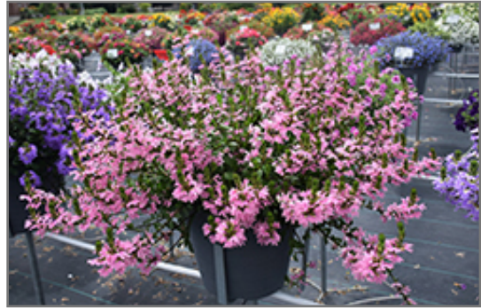
Whirlwind Pink Fan Flower in bloom

Whirlwind Pink Fan Flower is a fine choice for the garden, but it is also a good selection for planting in outdoor containers and hanging baskets. Because of its trailing habit of growth, it is ideally suited for use as a 'spiller' in the 'spiller-thriller-filler' container combination; plant it near the edges where it can spill gracefully over the pot. Note that when growing plants in outdoor containers and baskets, they may require more frequent waterings than they would in the yard or garden.