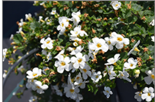
Snowstorm Snow Globe Bacopa flowers

Snowstorm Snow Globe Bacopa is recommended for the following landscape applications;