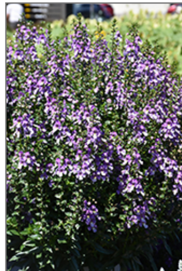
Archangel Blue Bicolor Angelonia flowers

Archangel Blue Bicolor Angelonia is an herbaceous annual with an upright spreading habit of growth. Its relatively fine texture sets it apart from other garden plants with less refined foliage.