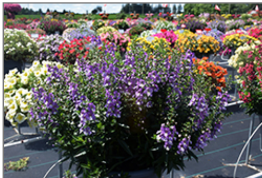
Archangel Blue Bicolor Angelonia in bloom