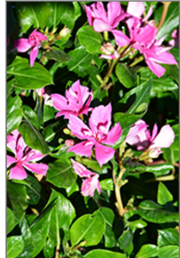
Soiree Kawaii Double Pink Vinca flowers

This plant will require occasional maintenance and upkeep, and should not require much pruning, except when necessary, such as to remove dieback. It is a good choice for attracting butterflies to your yard, but is not particularly attractive to deer who tend to leave it alone in favor of tastier treats. It has no significant negative characteristics.