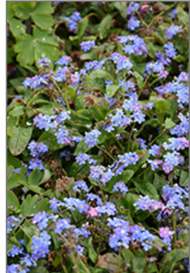
Victoria Blue Forget-Me-Not flowers

Victoria Blue Forget-Me-Not is recommended for the following landscape applications;