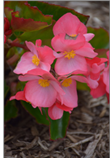
Megawatt Rose Green Leaf Begonia flowers

Megawatt Rose Green Leaf Begonia is an herbaceous annual with an upright spreading habit of growth. Its medium texture blends into the garden, but can always be balanced by a couple of finer or coarser plants for an effective composition.