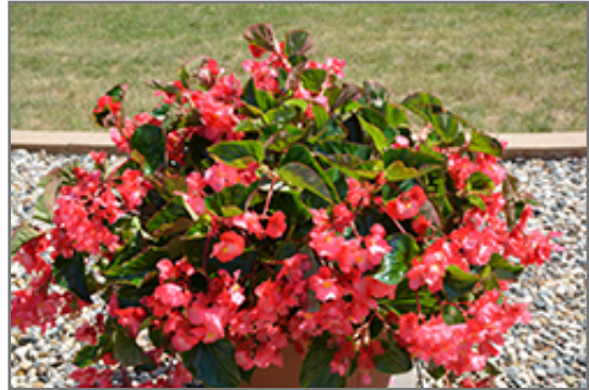
Megawatt Rose Green Leaf Begonia in bloom

Megawatt Rose Green Leaf Begonia is a fine choice for the garden, but it is also a good selection for planting in outdoor containers and hanging baskets. With its upright habit of growth, it is best suited for use as a 'thriller' in the 'spiller-thriller-filler' container combination; plant it near the center of the pot, surrounded by smaller plants and those that spill over the edges. It is even sizeable enough that it can be grown alone in a suitable container. Note that when growing plants in outdoor containers and baskets, they may require more frequent waterings than they would in the yard or garden.