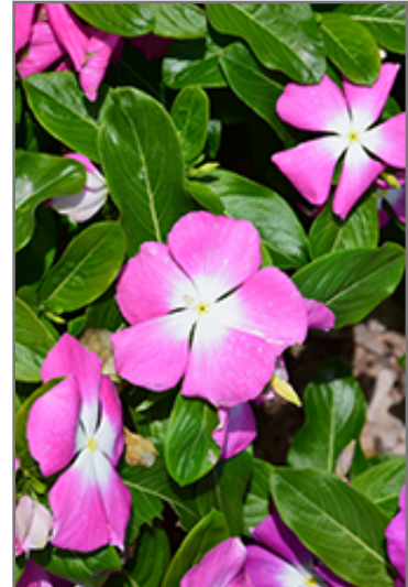
Mega Bloom Pink Halo Vinca flowers

Mega Bloom Pink Halo Vinca is a dense herbaceous annual with a mounded form. Its medium texture blends into the garden, but can always be balanced by a couple of finer or coarser plants for an effective composition.