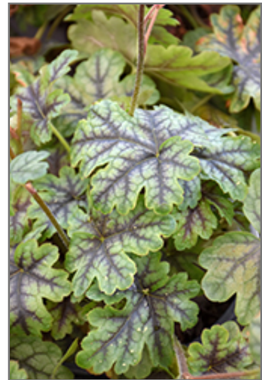
Tapestry Foamy Bells foliage