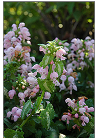
Shell Pink Spotted Dead Nettle flowers