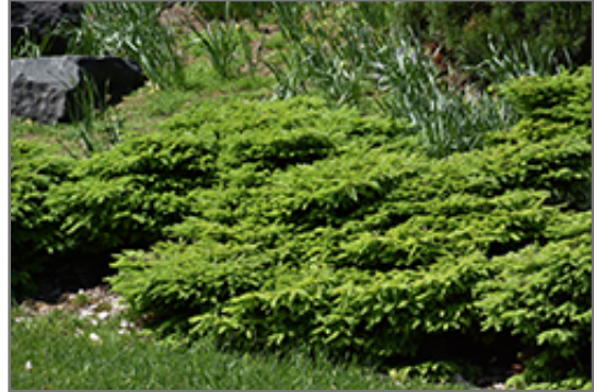
Little Gem Spruce

This shrub does best in full sun to partial shade. It does best in average to evenly moist conditions, but will not tolerate standing water. It is not particular as to soil type or pH, and is able to handle environmental salt. It is highly tolerant of urban pollution and will even thrive in inner city environments. This is a selected variety of a species not originally from North America.