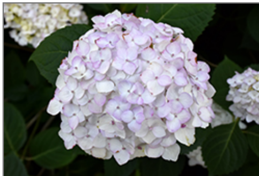
Blushing Bride Hydrangea flowers