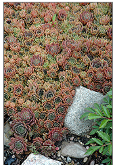
Silverine Hens And Chicks