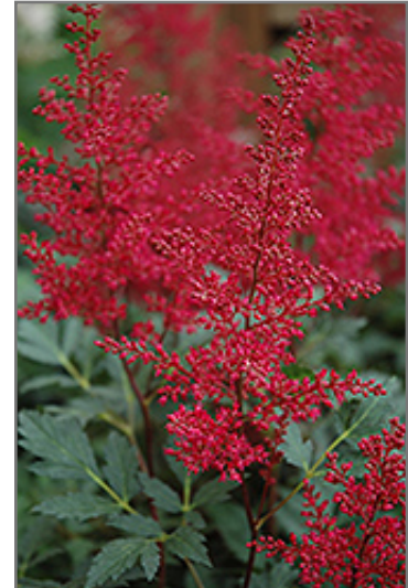
Red Sentinel Astilbe flowers

Red Sentinel Astilbe is recommended for the following landscape applications;