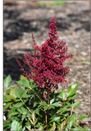
Red Sentinel Astilbe flowers

Red Sentinel Astilbe is a fine choice for the garden, but it is also a good selection for planting in outdoor pots and containers. With its upright habit of growth, it is best suited for use as a 'thriller' in the 'spiller-thriller-filler' container combination; plant it near the center of the pot, surrounded by smaller plants and those that spill over the edges. Note that when growing plants in outdoor containers and baskets, they may require more frequent waterings than they would in the yard or garden.