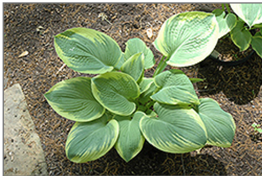
Robert Frost Hosta

Robert Frost Hosta is recommended for the following landscape applications;