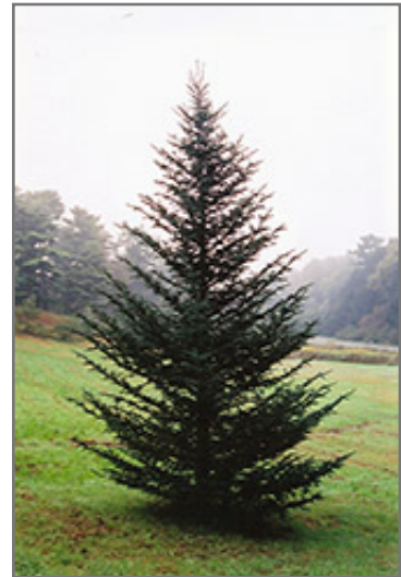
Fraser Fir