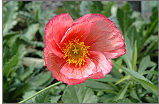
Champagne Bubbles Poppy flowers