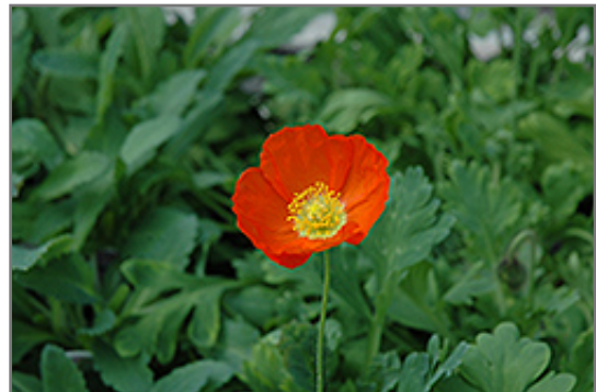
Champagne Bubbles Poppy flowers