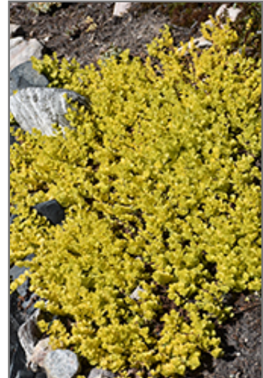
Goldilocks Creeping Jenny

Goldilocks Creeping Jenny is a fine choice for the garden, but it is also a good selection for planting in outdoor containers and hanging baskets. Because of its spreading habit of growth, it is ideally suited for use as a 'spiller' in the 'spiller-thriller-filler' container combination; plant it near the edges where it can spill gracefully over the pot. Note that when growing plants in outdoor containers and baskets, they may require more frequent waterings than they would in the yard or garden.