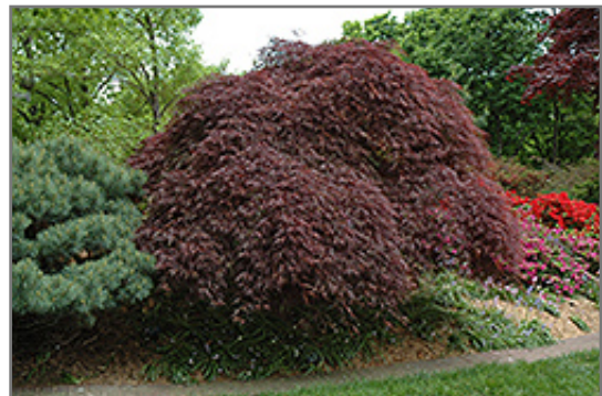
Red Select Cutleaf Japanese Maple