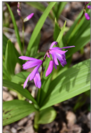
Lavender Japanese Hyacinth Orchid flowers