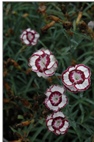
Raspberry Swirl Pinks flowers

This is a relatively low maintenance plant, and is best cleaned up in early spring before it resumes active growth for the season. It is a good choice for attracting bees and butterflies to your yard, but is not particularly attractive to deer who tend to leave it alone in favor of tastier treats. It has no significant negative characteristics.