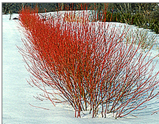
Cardinal Dogwood in winter