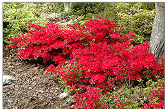
Hino Crimson Azalea in bloom