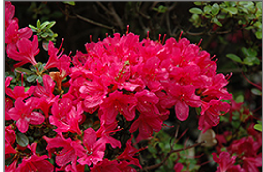
Hino Crimson Azalea flowers

This shrub does best in full sun to partial shade. You may want to keep it away from hot, dry locations that receive direct afternoon sun or which get reflected sunlight, such as against the south side of a white wall. It requires an evenly moist well-drained soil for optimal growth, but will die in standing water. It is very fussy about its soil conditions and must have rich, acidic soils to ensure success, and is subject to chlorosis (yellowing) of the foliage in alkaline soils. It is somewhat tolerant of urban pollution, and will benefit from being planted in a relatively sheltered location. Consider applying a thick mulch around the root zone in winter to protect it in exposed locations or colder microclimates. This particular variety is an interspecific hybrid.