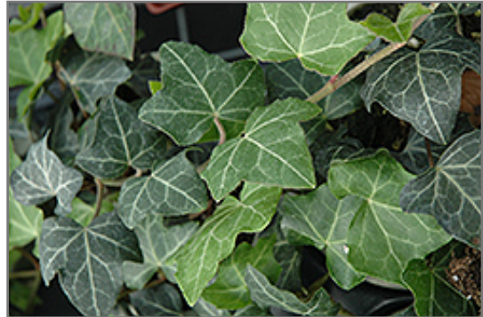
Baltic Ivy foliage

Baltic Ivy is recommended for the following landscape applications;