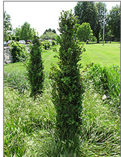
Graham Blandy Boxwood