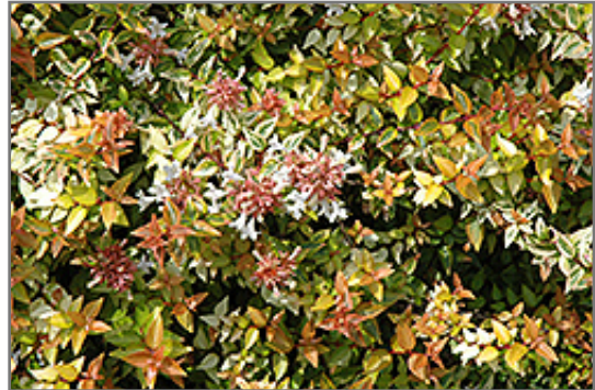
Kaleidoscope Abelia flowers

This shrub will require occasional maintenance and upkeep, and should only be pruned after flowering to avoid removing any of the current season's flowers. It is a good choice for attracting birds, bees and butterflies to your yard, but is not particularly attractive to deer who tend to leave it alone in favor of tastier treats. It has no significant negative characteristics.