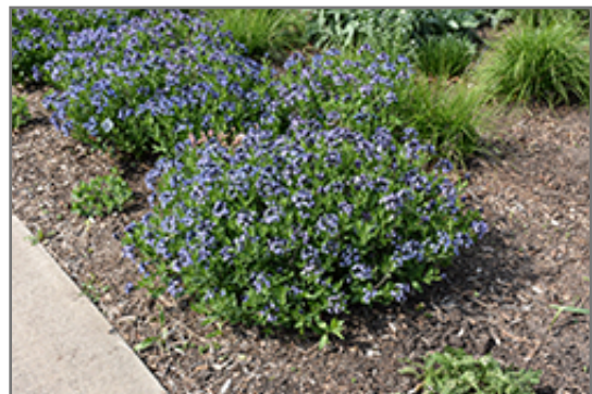
Blue Ice Star Flower in bloom