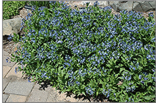
Blue Ice Star Flower in bloom

This plant does best in full sun to partial shade. It prefers to grow in average to moist conditions, and shouldn't be allowed to dry out. It is not particular as to soil type or pH. It is quite intolerant of urban pollution, therefore inner city or urban streetside plantings are best avoided. This is a selection of a native North American species. It can be propagated by cuttings; however, as a cultivated variety, be aware that it may be subject to certain restrictions or prohibitions on propagation.